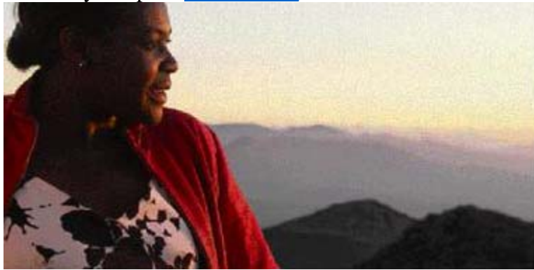
Dr. Maggie Aderin

For Dr. Maggie Aderin, science is life-and life is fun.